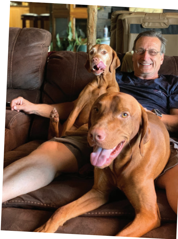
Relaxing at home with hunting dogs Sassy and Rambo.

Create MEMORIES... that last a lifetime!