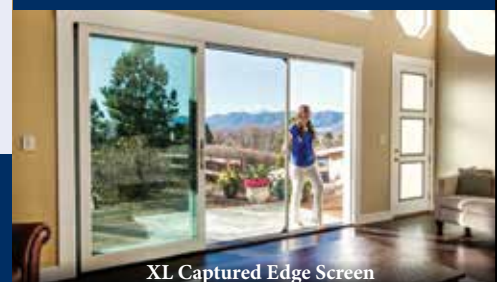
XL Captured Edge Screen