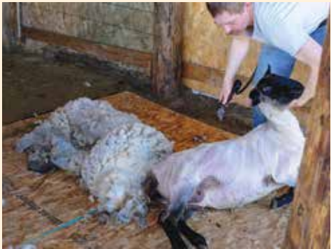
Shearing sheep in Minden, Nevada