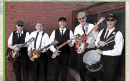
July 26: Beatles Flashback

*High-back chairs will only be allowed on the flat grass at the top of the bowl. Chairs placed on the slanted grass (the bowl) must be low-back chairs or blankets only.